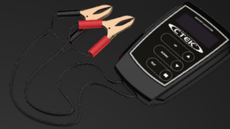
CTEK Battery Analyzer