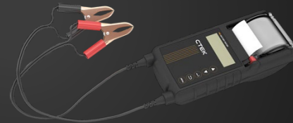
PRO Battery Tester